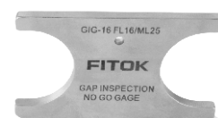
Fig.1 Individual Sizes Series

These gauges can be used to inspect initial makeup on fittings installed from finger-tight position.