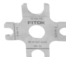
Fig.2 Multiple Sizes Series